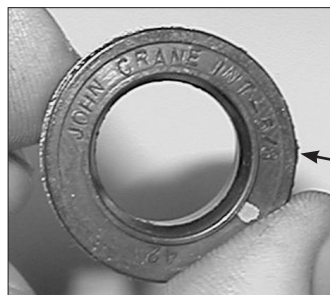
This side mates against the impeller.